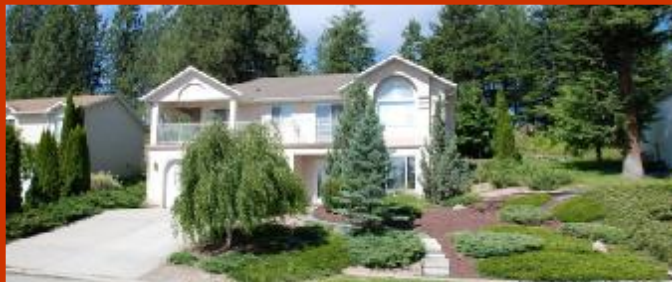
MLS® #9194762 2480 Alexandria Way, Westbank $479,900