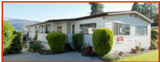
MLS® #9189662 151-Old Boucherie Rd, Westbank $144,900