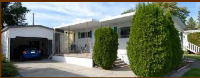
MLS® #9202742 28-1929 HWY 97 S, Kelowna $94,900