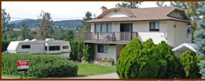
MLS® #9200838 10544 Bonnie Drive, Lake Country $499,900