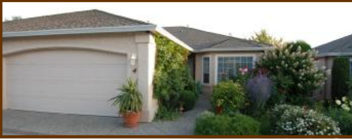
MLS® #9202743 4-2250 Louie Dr., Westbank $319,900