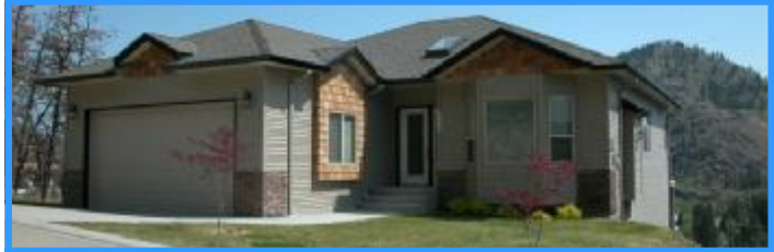
MLS® #9205300 2985 Ensign Lane, Westbank $569,900