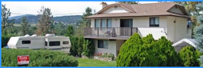
MLS® #9200838 10544 Bonnie Drive, Lake Country $499,900