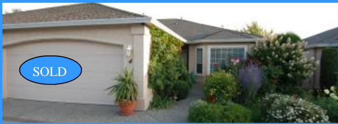
MLS® #9202743 4—2250 Louie Dr., Westbank $319,900