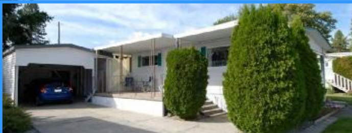
MLS® #9202742 28-1929 HWY 97 S, Kelowna $87,300

On The creek! Fully operational well with electric pump & power runs to property. 4 acres divided into two parcels by Trepanier Road. Peaceful, Private in beautiful Paradise Valley. Can be used as a hobby farm/mobiles O.K.