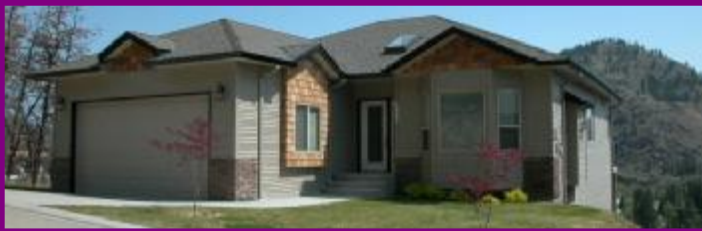
MLS® #9205300 2985 Ensign Lane, Westbank $569,900