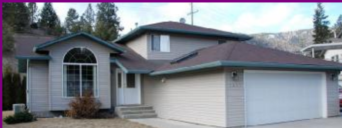
MLS® #9209842 2432 Asquith Court, Westbank $374,900