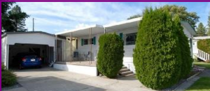
MLS® #9202742 28-1929 HWY 97 S, Kelowna $79,700