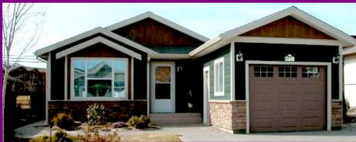
MLS® #9208050 2209 Mimosa Drive, Westbank $265,500