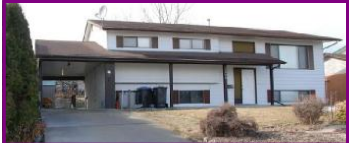
3576 Springer Road, Westbank MLS® #9 210900 $359,900