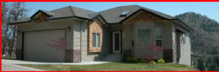
MLS® #9205300 2985 Ensign Lane, Westbank $569,900