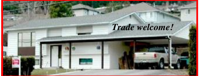
MLS® #9211502 3420 McGinnis, Westbank $387,500