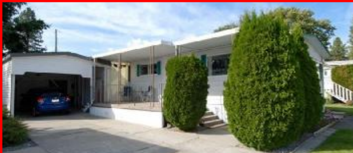
MLS® #9202742 28-1929 HWY 97 S, Kelowna $79,700