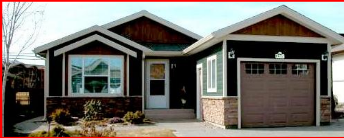
MLS® #9208050 2209 Mimosa Drive, Westbank $265,500