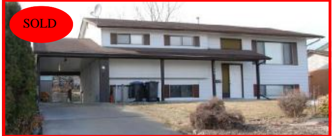
3576 Springer Road, Westbank MLS® #9 210900 $359,900