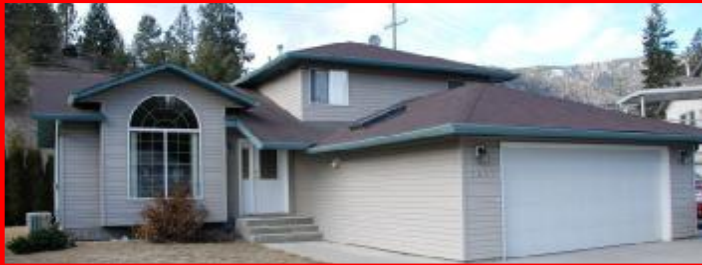
MLS® #9209842 2432 Asquith Court, Westbank $364,900