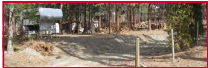
MLS® #9211402 Lot 68-5 Elk Road, Westbank $139,000