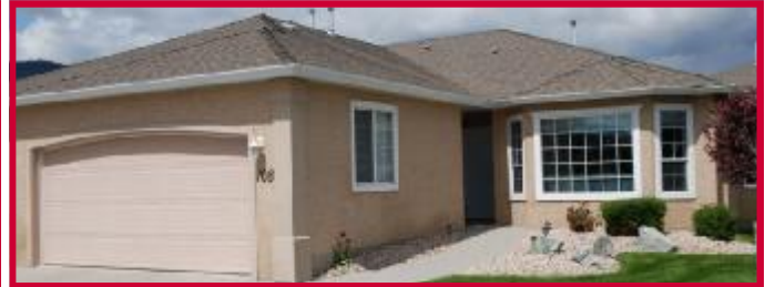
MLS® #9215306 108-2250 Louie Drive, Westbank $309,000