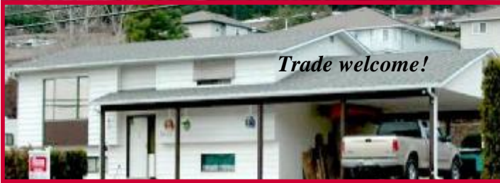
MLS® #9211502 3420 McGinnis, Westbank $374,900