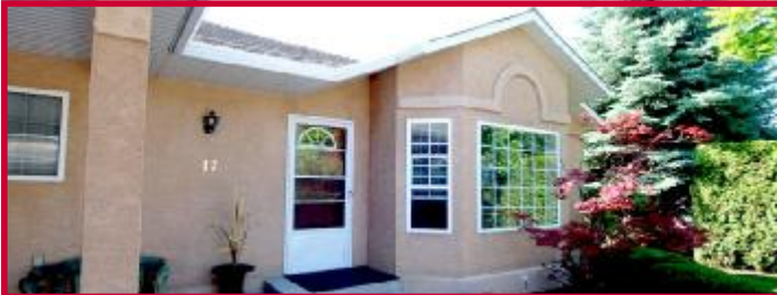
MLS® #9216244 17-2210 Louie Drive, Westbank $295,800