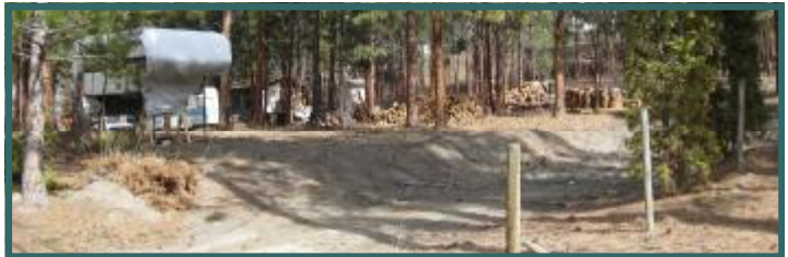
MLS® #9211402 Lot 68-5 Elk Road, Westbank $139,000