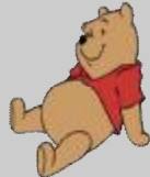
Winnie The Pooh