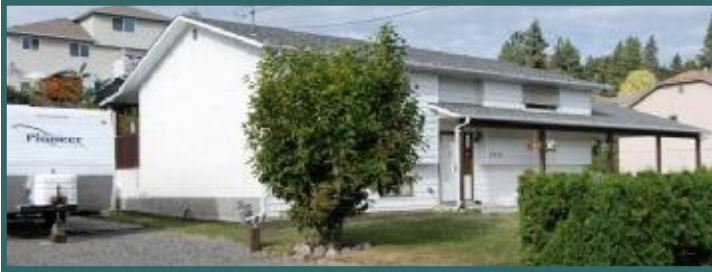
MLS® #9223411 3420 McGinnis, Westbank $363,800