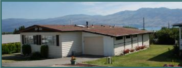
MLS® #9221428 75-2098 Boucherie Rd. Westbank $79,900