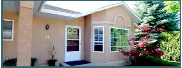
MLS® #9216244 17-2210 Louie Drive, Westbank $289,900