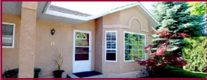
MLS® #9225835 17-2210 Louie Drive, Westbank $279,800