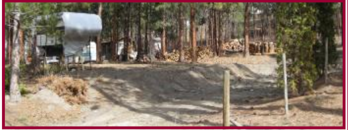
MLS® #9211402 Lot 68-5 Elk Road, Westbank $139,000