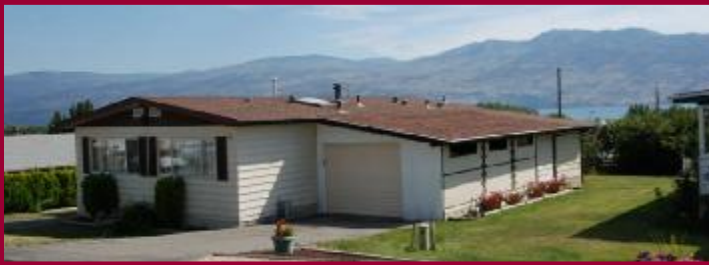
MLS® #9221428 75-2098 Boucherie Rd. Westbank $74,900